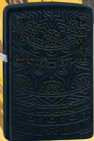
29989 BLACK MATTE COLOR IMAGE $24.95