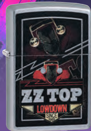
49008 STREET CHROME™ COLOR IMAGE $24.95

©2019 Leidseplein Presse B.V. Under License to Perryscope Productions / Epic Rights