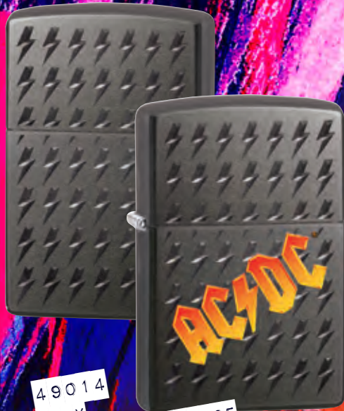
49014 GRAY ICED/COLOR IMAGE $39.95