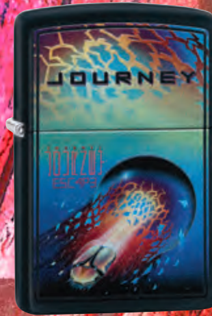
49029 BLACK MATTE COLOR IMAGE $31.95