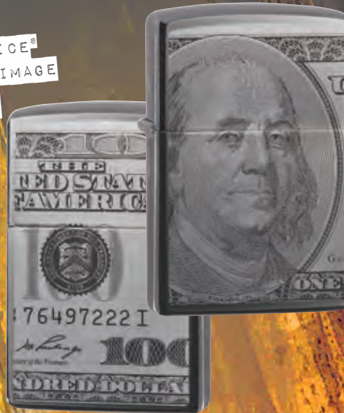
49025 BLACK ICE® PHOTO IMAGE $37.95

That's why currency is such a hot fashion & design trend right now. If they can't flaunt a stack of $100s, this Black Ice lighter Photo Imaged with a Benjamin on front and back is the next best thing.