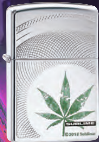
49016 HIGH POLISH CHROME COLOR IMAGE/ AUTO ENGRAVE $36.95