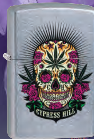
49011 STREET CHROME™ COLOR IMAGE $24.95