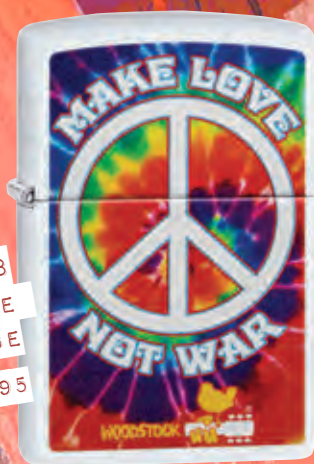
49013 WHITE MATTE COLOR IMAGE $30.95

© 2019 Cypress Hill Musik. Under License to Epic Rights.