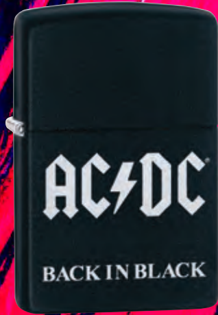
49015 BLACK MATTE COLOR IMAGE $28.95