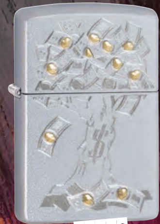
29999 SATIN CHROME AUTO TWO TONE $22.95