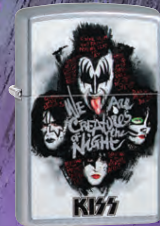
49018 STREET CHROME™ COLOR IMAGE $24.95

© 2019 KISS Catalog, Ltd. Under License to Epic Rights.