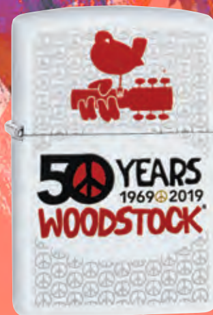
49012 WHITE MATTE COLOR IMAGE $30.95