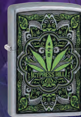
49010 STREET CHROME™ COLOR IMAGE $24.95

© 2019 Cypress Hill Musik. Under License to Epic Rights.