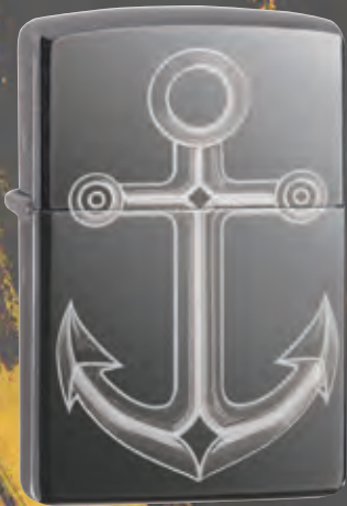
49028 BLACK ICE® LASER FANCY FILL $31.95