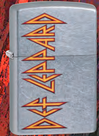
49009 STREET CHROME™ COLOR IMAGE $24.95

© 2019 Nomota LLC. Under License to Epic Rights.