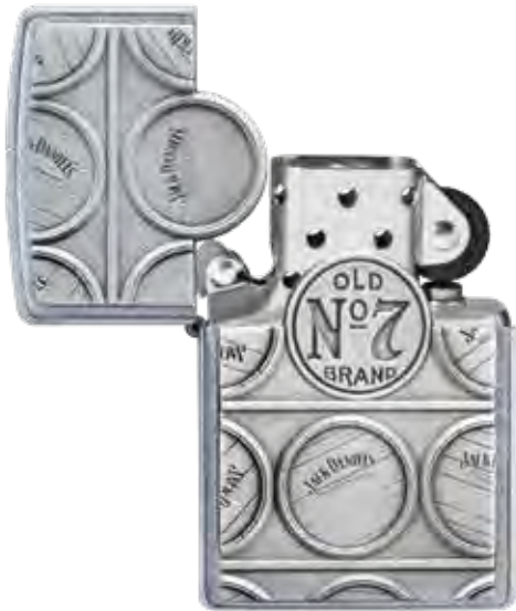
29817 Street Chrome™ Emblem Attached $45.95

Available in selected countries, some restrictions may apply.