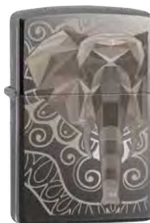
49074 Black Ice® Laser Engrave/Fancy Fill $33.95