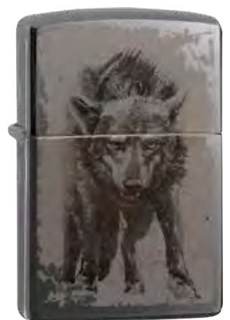
49073 Black Ice® Photo Image $31.95