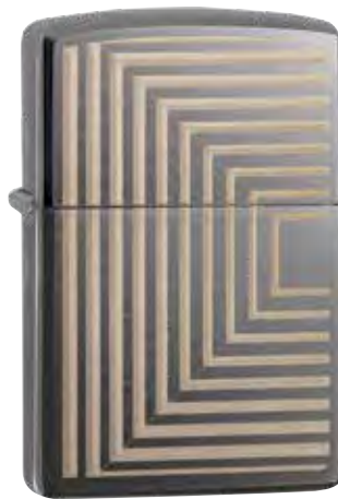
49071 Black Ice® Laser Fancy Fill $31.95

Available in selected countries, some restrictions may apply.