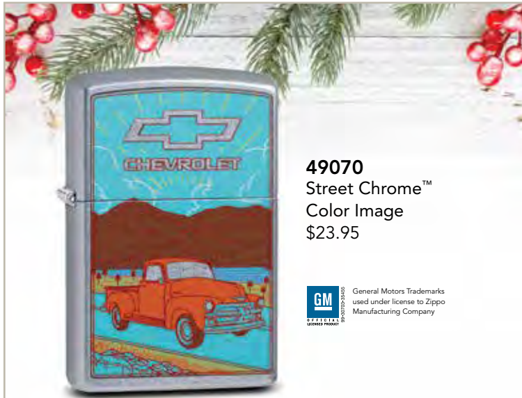
49070 Street Chrome™ Color Image $23.95

Consumer testing of all stock designs allows Zippo to select only the lighters that scored the highest approval ratings for our catalogs, making sure that there are must-have designs at every price point for your retail sales.