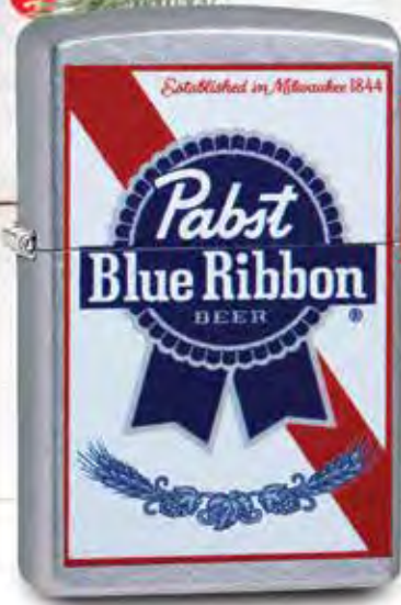
49078 Street Chrome™ Color Image $23.95