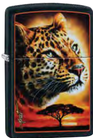
49068 Black Matte Color Image $28.95

Manufactured and distributed under license from Pabst Brewing Company, LLC ("PBC") by Zippo Manufacturing Company. [PABST BLUE RIBBON, COLT 45, OLD MILWAUKEE, LONE STAR] and related trademarks, logos, names and designs are trademarks and intellectual property of PBC. © 2019 All rights reserved.