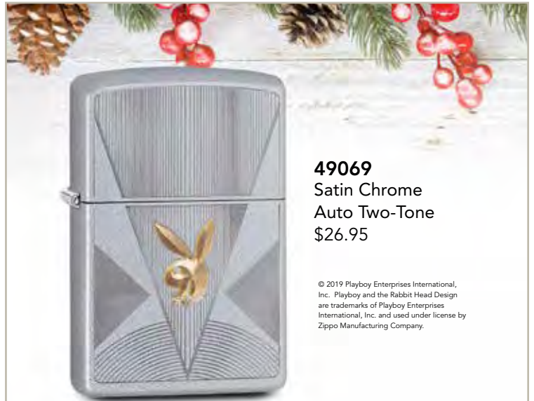
49069 Satin Chrome Auto Two-Tone $26.95

Available in selected countries, some restrictions may apply.