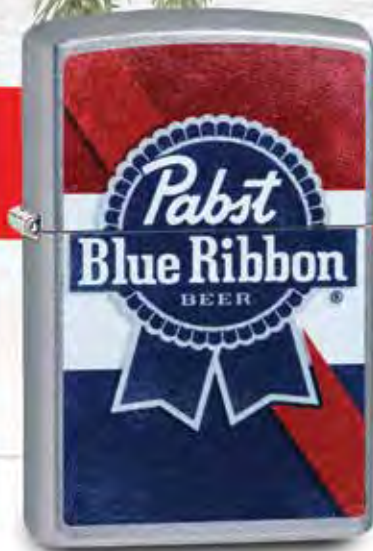
49077 Street Chrome™ Color Image $23.95