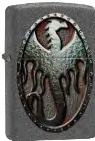
49072 Iron Stone® Color Image $26.95