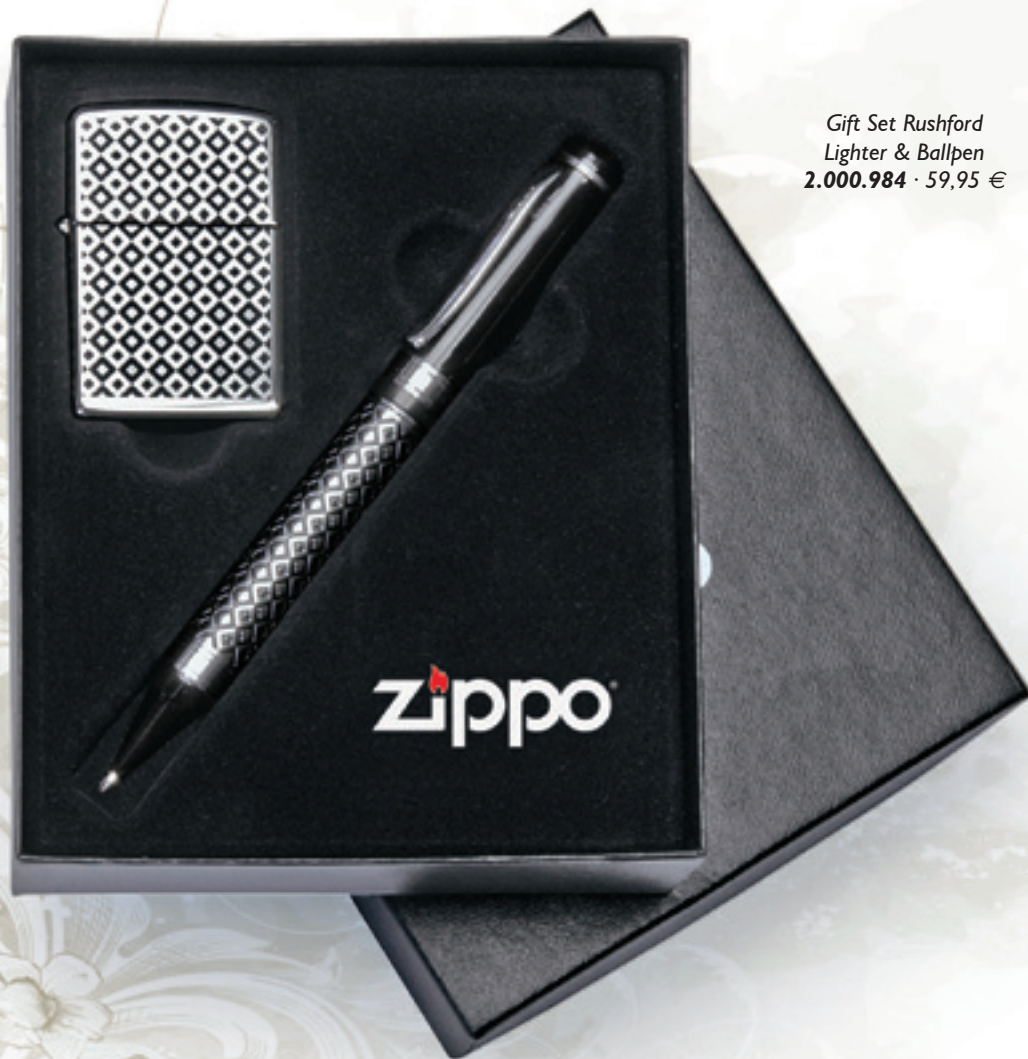
Gift Set Rushford Lighter & Ballpen 2.000.984 · 59,95 €