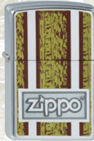
Yellow Lines Marble 2.000.709 #250 · 49,95 €