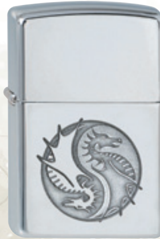
Dragon Circle 2.000.986 #250 · 39,95 €