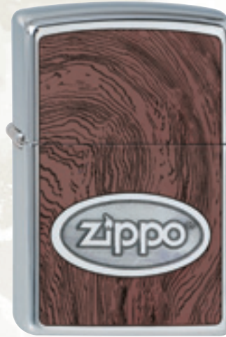
Zippo Wood 2.000.707 #250 · 49,95 €