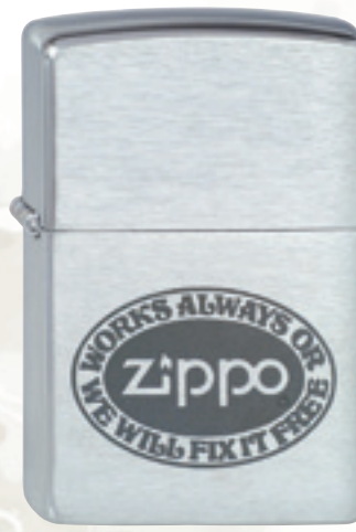
Zippo Always Works 1.901.314 #200 · 31,- €