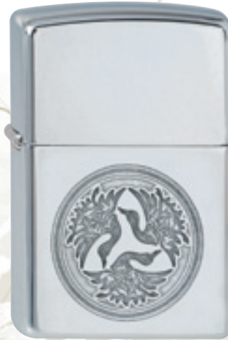
Birds Circle 2.000.988 #250 · 39,95 €