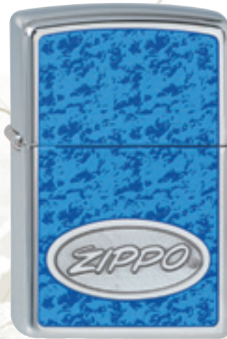
Zippo Blue Marble 2.000.708 #250 · 49,95 €

A charming combination of a surface imprint and a double lustre process which gives the zippo lighter an elegant aristocratic touch.