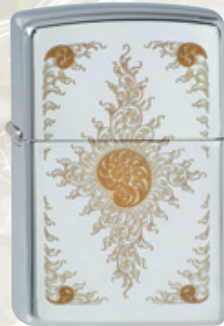
English Pattern 1.410.176 #250 · 42,95 € © 2007 Barrett-Smythe all rights reserved