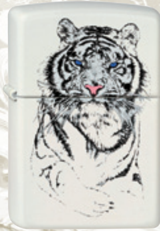
White Tiger 2.000.985 #214 · 39,95 €