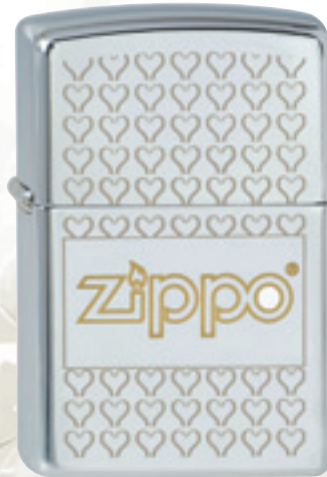
Multi Hearts 1.410.165 #250 · 39,95 €