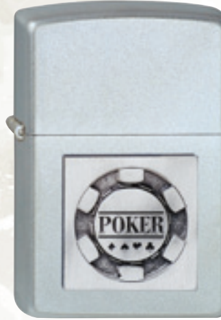
Poker 1.320.060 #205 · 39,95 €