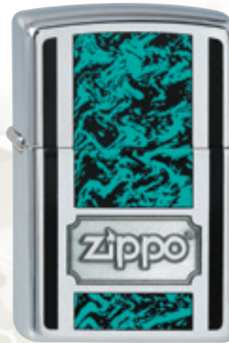
Zippo Green Marble 2.000.706 #250 · 49,95 €