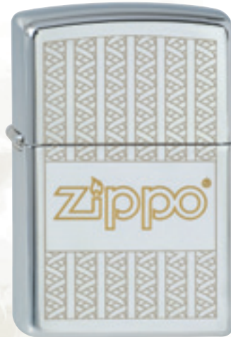
Zippo Arces 1.410.166 #250 · 39,95 €