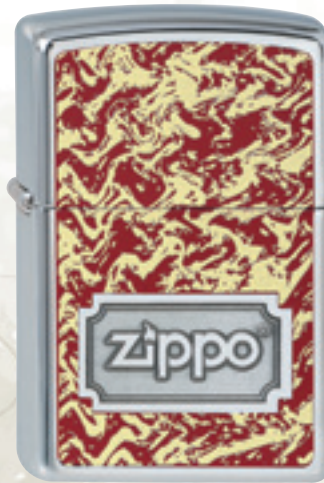
Zippo Red Marble 2.000.705 #250 · 49,95 €