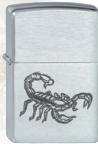
Scorpion 1.901.306 #200 · 31,- €