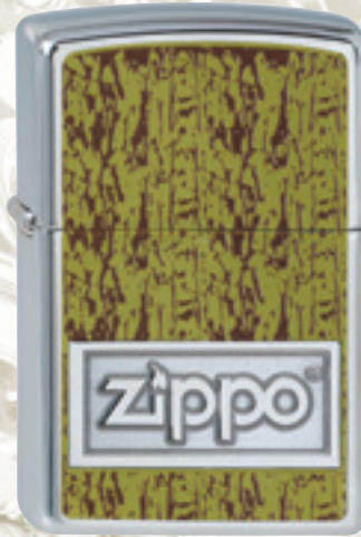
Zippo Yellow Marble 2.000.704 #250 · 49,95 €