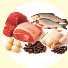
Fish, insects, and animal source foods