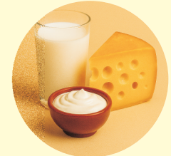
Milk and milk products