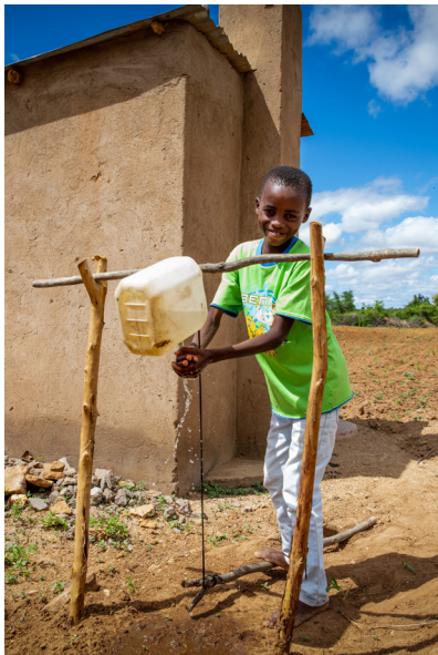
A child demonstrates how to use the tippy tap after using the bathroom.

AMC, ENSURE technical, and AGRITEX staff was whether the communities will be able to sustain these assets when ENSURE comes to an end in 2020. The interviewees unanimously agreed they will be able to manage and sustain these assets. Nearly all of them were quick to point out the main reasons for this include: having good training; putting in place an effective constitution and enforcement mechanism; and strong linkages with the Ministry of Agriculture (AGRITEX), the District Environmental Management Office, the District Civil Protection Committee and the Environmental sub-Committee. ENSURE staff and AGRITEX staff also confirmed that adequate capacity had been built at the village and community levels to link them with district level institutions (i.e. District Civil Protection Committee, District Environment Committee) for technical support.