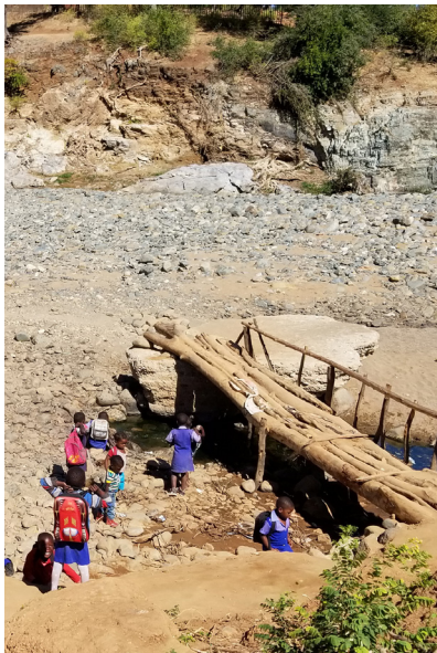
Cyclone Idai impacted the school bridge in Chipinge District, Ward 4.