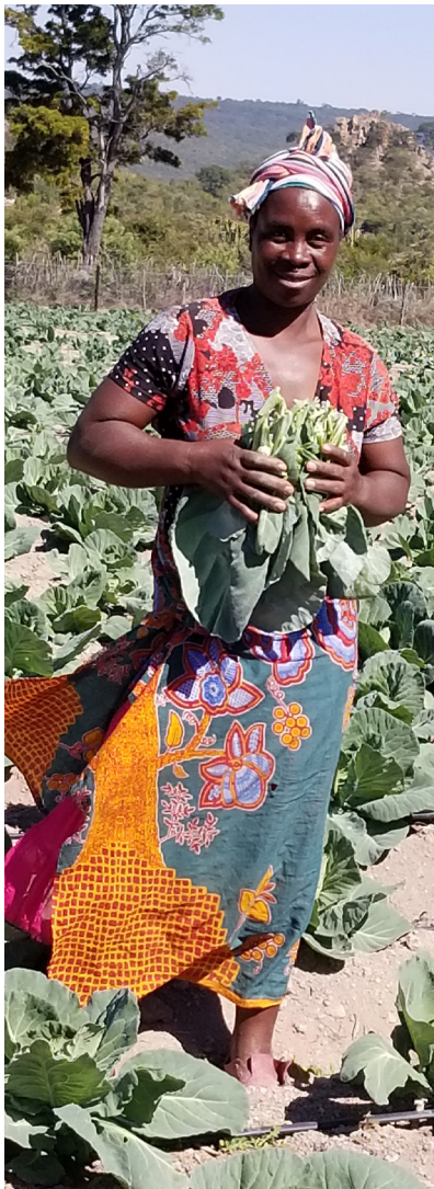
A woman harvests vegetables in the Chimanimani District, Ward 4.

importance of market access was seen in the Nemaramba Garden in the Chimanimani District, where local businesses in Mutare were coming with small trucks directly to the garden and buying and transporting tomatoes to their businesses.