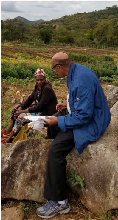
An individual interview is conducted with the Chair of the Asset Management Committee, Bikita District, Ward 2.

For example, in all the wards visited, the Environmental Sub-Committee (under District Environment Committee) is closely linked and actively supporting the community institutions created by ENSURE (i.e. Asset Management Committee, Watershed Management Committee, Disaster Management Committee) in the formulation of by-laws, the environmental patrol of the dam area, and the garden, as well as in organizing environmental awareness campaigns and events.