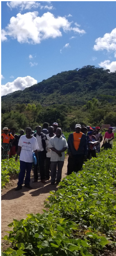
A member of a community garden shows the site to the review team in Zaka district, Ward 25.

One of the innovative agricultural practices introduced and enforced through the garden constitutions is the cropping calendar. All members must plant and harvest crops according to the planting calendar they develop in close consultation with the AGRITEX officer and ENSURE field staff. Some of these practices include: crop rotation aimed at enhancing soil fertility and pest and disease control; planting of different species with different rooting depths so they are able to absorb more micro-nutrients; avoiding planting tomatoes after potatoes and squash since they have similar pest predators; planting carrots, sugar beans, and cabbages after tomatoes; and planting legumes such as beans that fix nitrogen in the soil.