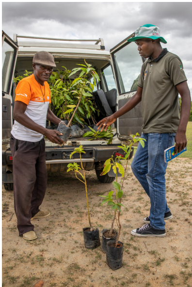
Fruit trees are prepared for transplant to the community garden.

All the ESCs we visited during this review were found to be highly functional. The ESCs are actively supporting the Watershed Management Committee and the Asset Management Committee in the formulation of by-laws, in the environmental patrol of the dam area and the garden, in conducting awareness campaigns, and in organizing environmental events and field days at the village. The ESCs are collaborating with the neighboring ward to protect common watersheds and rivers, and are bringing issues, environmental plans, and recommendations to the District Council and EMA. The ESC also works closely with local authorities to enforce the by-laws. For example, if one is found contravening any section of the by-laws, such as cutting trees without permission, it is reported to the village head, a penalty is imposed, and the ESC or the AMC step in to fund any needed services or repairs.