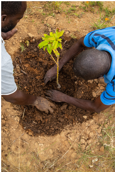
Irrigation Committee members plant fruit trees.