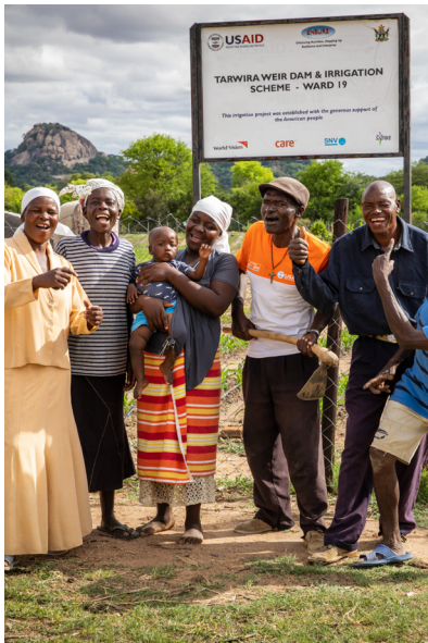
Irrigation Committee members pose in front of the community garden and irrigation project.

have been able to invest in food items and buy other assets, such as poultry, that are needed by their families. The importance of women empowerment was well articulated by one woman member of the Executive Committee of the AMC in Zaka District, Chemvuu Garden (Ward 14), who said, “If you want your family to be successful, let women have equal power.”