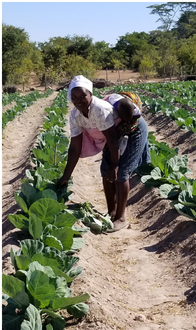
A woman farms the land in Chiramba 2 Garden, Chimanimani District, Ward 4.

AMC, the DRR Committee, and Watershed Management Committee—has given a platform for community members to come together towards a common development agenda and to share information and experience. Some of the interviewed farmers, who are not members of the garden (in the Chipinge, Chimanimani and Bikita Districts), indicated they have learned improved agricultural practices from their neighbors and friends who are members of the garden. They are now, for example, applying mulching and composting to maintain soil fertility as they are not able to afford fertilizers.