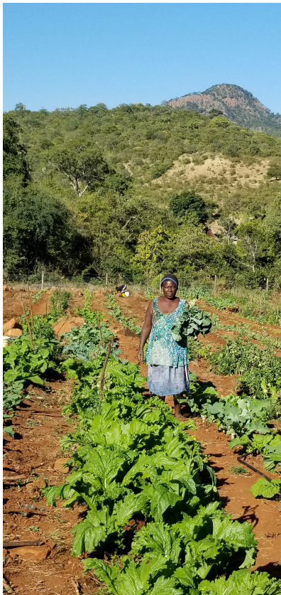
A women farmer displays vegetables in Chipinge, Ward 4.