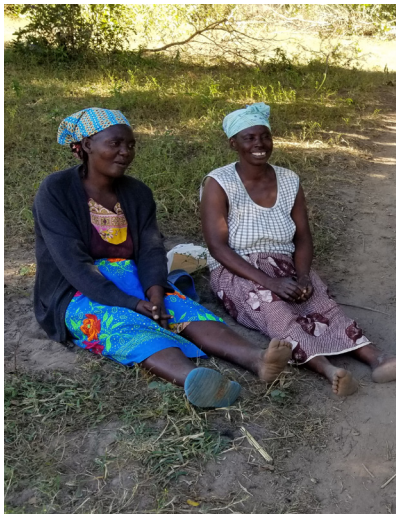
The women above, from the Executive Members Asset Management Committee in Zaka District, Ward 14, were interviewed.