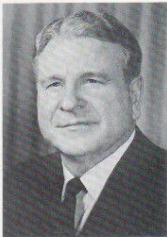
DR. W. A. CRISWELL