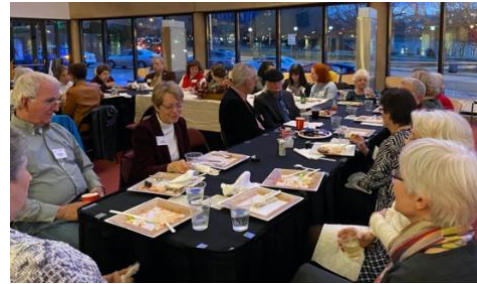
Members enjoyed a delicious meal and vibrant conversation.