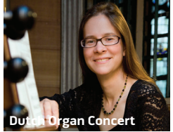
Dutch Organ Concert