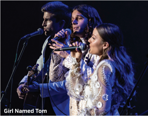
Girl Named Tom