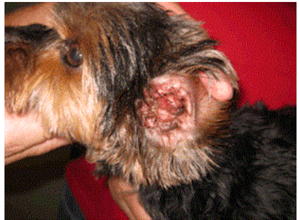
Chronic inflammation has led to proliferation of ear tissue. Bacteria and discharge can hide in all the nooks and crannies. The vertical canal has been surgically opened so as to facilitate cleaning.