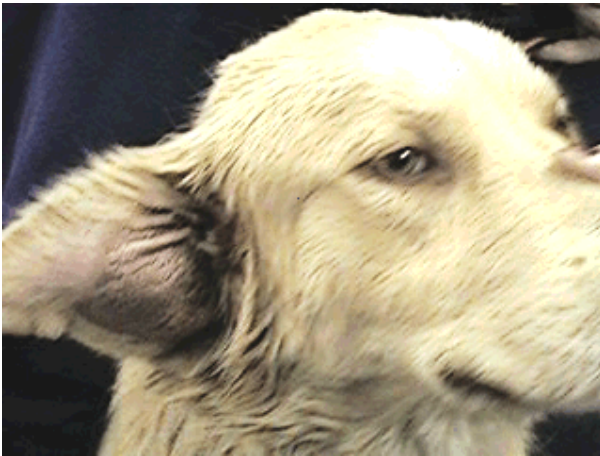
Aural hematoma in a dog's earflap.