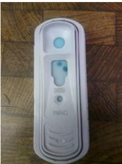
A positive test.

Any kitten with fever, appetite loss, diarrhea, and/or vomiting is a suspect for feline distemper. Classically, a white blood cell count shows almost no white blood cells; there are few causes of white cell counts this low and the infection can be considered confirmed.