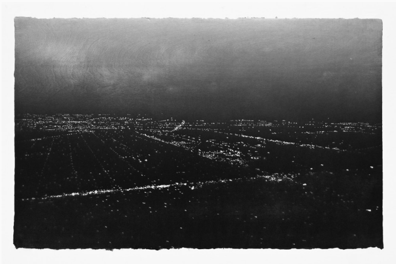
Susan Goethel Campbell (American, b. 1956). Aerials: Other Cities #2 , 2012. Relief print on paper. Grand Rapids Art Museum, Museum Purchase, 2014.11. © Susan Goethel Campbell