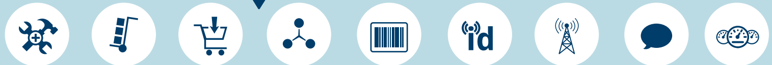
fig 2. solutions menu

work orders inventory purchase orders agencies assets id mgmt sites alerts dashboards