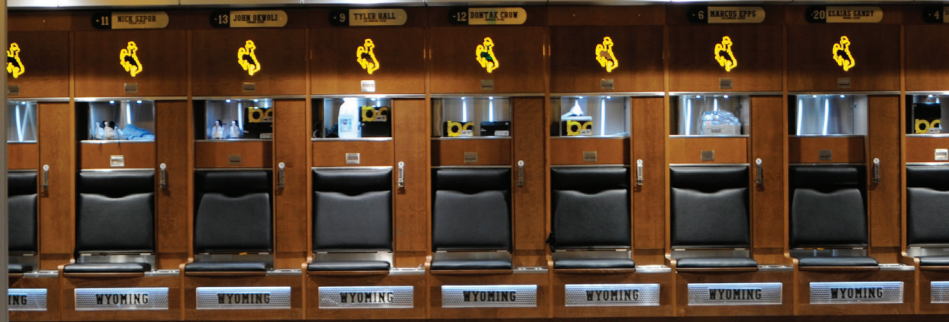
Football Locker Room