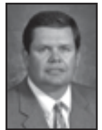
JOE LEGERSKI Women's Basketball