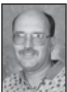
DON YENTES Men's and Women's Track and Field