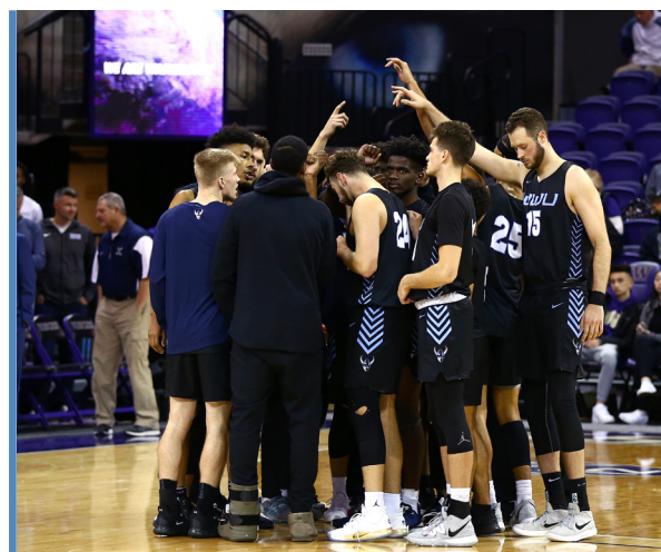
2019-20 Vikings Playing at UW.