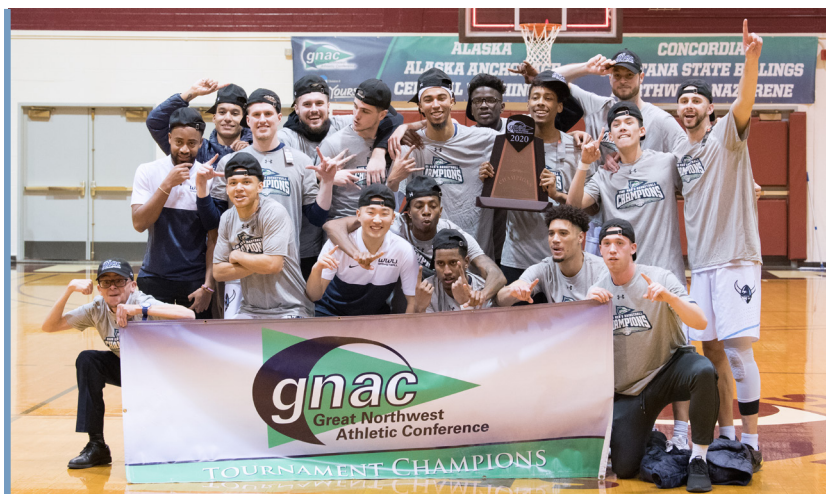
WWU won the 2020 GNAC Tournament Championship