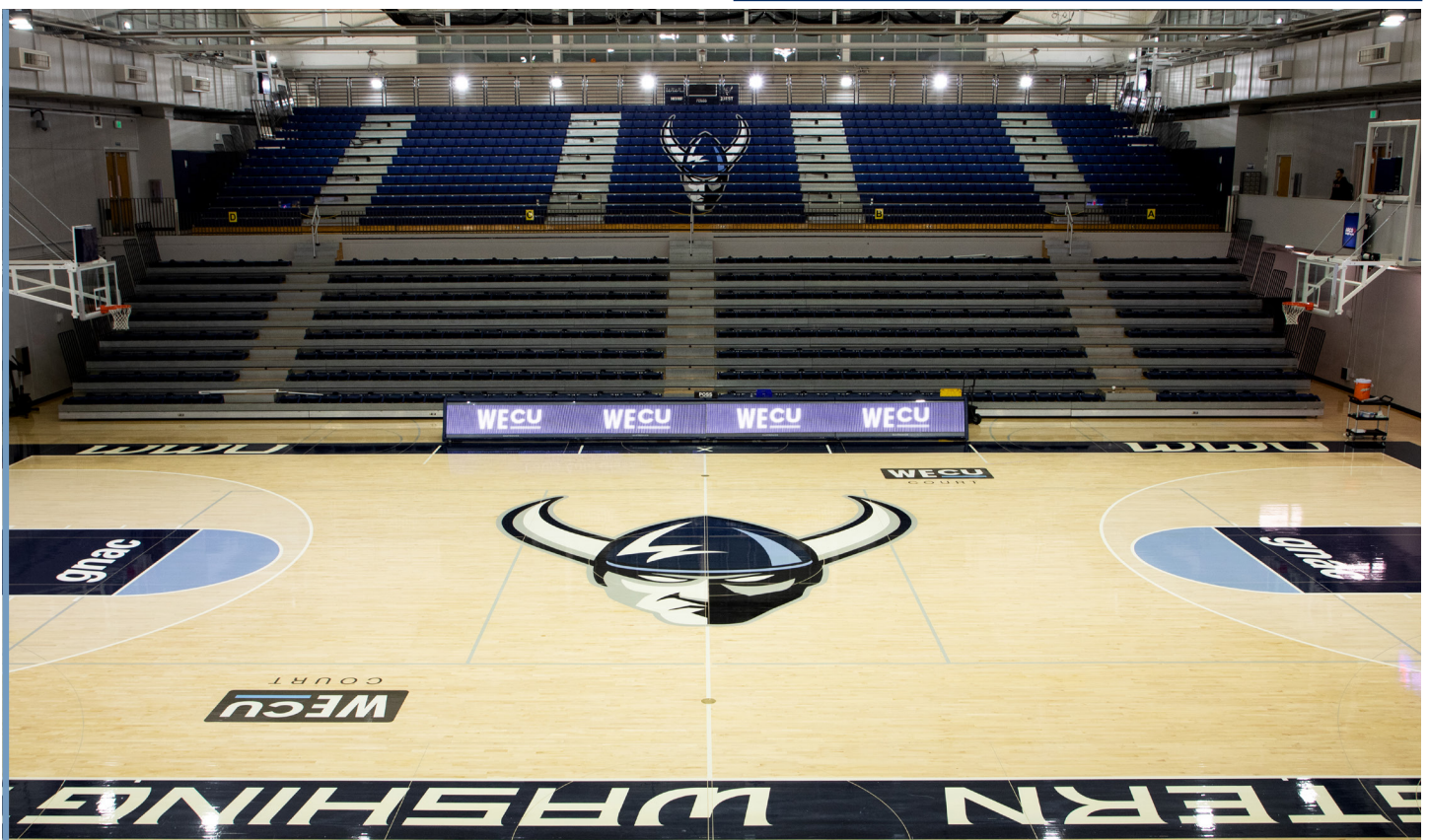
WECU Court in Carver Gym

The WWU Men's Basketball program recorded win No. 1500 on December 15, 2019 with a 126-72 victory over Capilano on WECU Court in Carver Gym. The Vikings reached the mark in the 118th season of men's basketball history. WWU is one of fewer than 20 NCAA Division II programs that has recorded at least 1,500 wins.