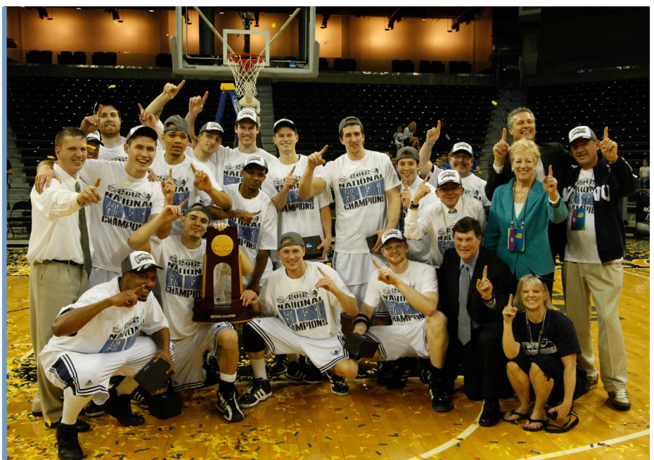
WWU won the 2012 NCAA Division II National Championship

1985 Cal State Hayward 1986 Cal State Hayward 1987 Montana State-Billings 1988 Alaska Anchorage 1989 UC Riverside 1990 Cal State Bakersfield 1991 Cal State Bakersfield 1992 Cal State Bakersfield 1993 Cal State Bakersfield 1994 Cal State Bakersfield 1995 UC Riverside 1996 Cal State Bakersfield 1997 Cal State Bakersfield 1998 UC Davis 1999 Cal State San Bernardino 2000 Seattle Pacific 2001 WESTERN WASHINGTON 2002 Cal State San Bernardino 2003 Cal Poly Pomona 2004 Humboldt State 2005 Cal Poly Pomona 2006 Seattle Pacific 2007 Cal State San Bernardino 2008 Alaska Anchorage 2009 Cal Poly Pomona 2010 Cal Poly Pomona 2011 BYU-Hawaii 2012 WESTERN WASHINGTON 2013 WESTERN WASHINGTON 2014 Chico State 2015 Azusa Pacific 2016 Western Oregon 2017 Chico State 2018 California Baptist 2019 Point Loma 2020 No Champion - COVID-19 2021 Colorado School of Mines 2022 Chico State 2023 Cal State San Bernardino