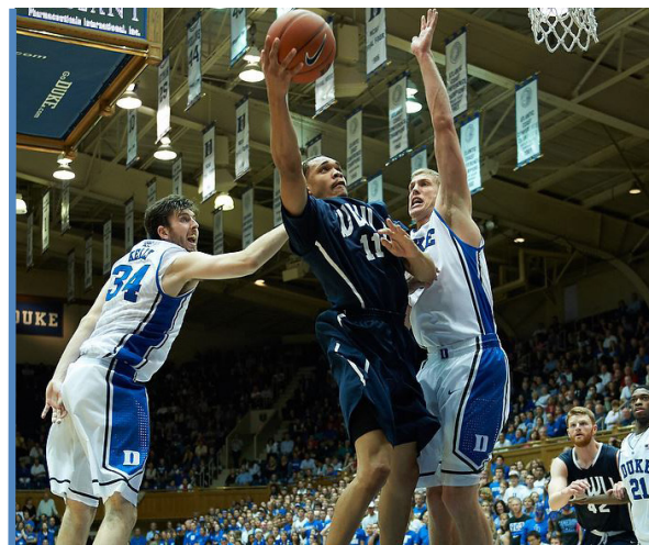
WWU played Duke in an exhibition game on Oct. 27, 2012 in Cameron Indoor Stadium.