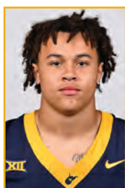
DB, 6-1, 192, So. Appalachian State Atlanta, Ga.