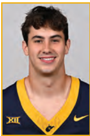
K, 6-1, 185, So. Tulane Glen Ellyn, Ill.