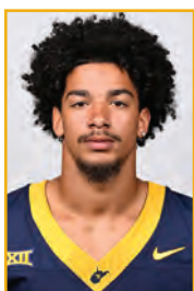
WR, 5-9, 162, r-Sr. Jacksonville State Martinsburg, W.Va.