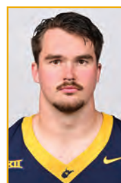
DT, 6-3, 282, r-Sr. French Finnish School of Helsinki Helsinki, Finland