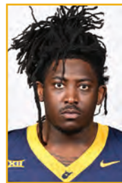
DL, 6-5, 288, Sr. Missouri Orlando, Fla.