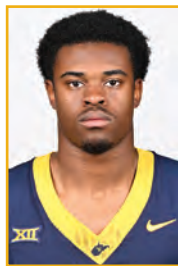
BAN, 6-4, 226, So. Cabell Midland Huntington, W.Va.