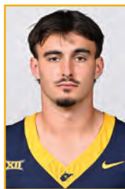
P, 6-2, 210, Sr. Mentone Grammar School Melbourne, Australia