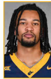
QB, 6-3, 227, r-Sr. Texas A&M Los Angeles, Calif.