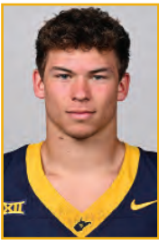
RB, 5-9, 194, So. IMG Academy Leesburg, Va.