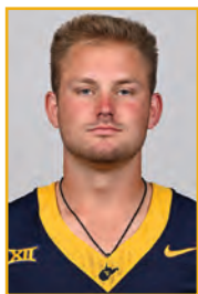
K, 5-10, 189, r-Sr. Coastal Carolina Johnson City, Tenn.