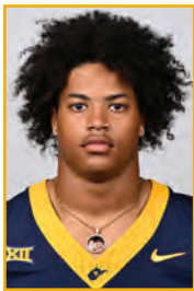
S, 5-11, 190, So. Douglas County Douglasville, Ga.