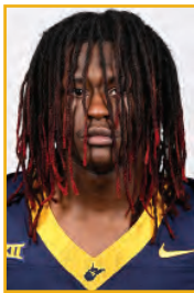
S, 5-10, 185, r-Sr. Jacksonville State Birmingham, Ala.