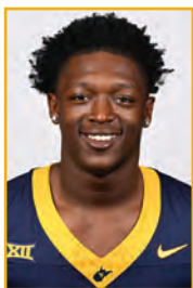
S, 5-9, 194, r-Sr. Akron Akron, Ohio