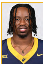
S, 6-0, 200, Sr. Jacksonville State Monrovia, Liberia