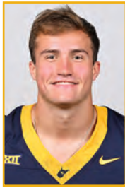
LB, 6-2, 230, r-Sr. Ohio State Ironton, Ohio