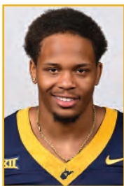
RB, 5-10, 189, r-Fr. Gahanna Lincoln Gahanna, Ohio