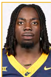
N/S, 5-11, 206, Sr. Jacksonville State Vienna, Ga.