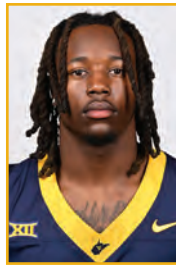
CB, 5-11, 189, Sr. Appalachian State Charlotte, N.C.