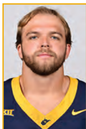
LB, 6-1, 230, r-Sr. Colorado State Arvada, Colo.