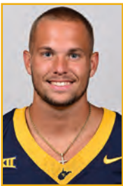
PR, 5-10, 192, r-Sr. Morgantown Morgantown, W.Va.