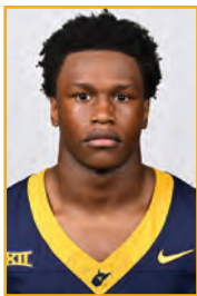
RB, 5-10, 191, So. Iowa Central CC Harrisburg, Pa.