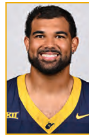
DL, 6-2, 265, r-Sr. Incarnate Word San Antonio, Texas