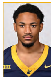
WR, 6-2, 185, r-So. Jacksonville State Villa Rica, Ga.