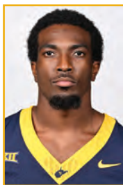
WR, 5-11, 185, r-Sr. S.C. State Port St. John, Fla.