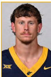
WR, 6-2, 211, r-Sr. Idaho State Salinas, Calif.