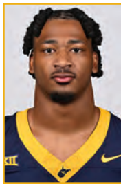
CB, 5-11, 166, r-Sr. South Alabama Kansas City, Mo.