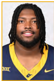
DL, 6-3, 312, r-Sr. Dublin Coffman Dublin, Ohio