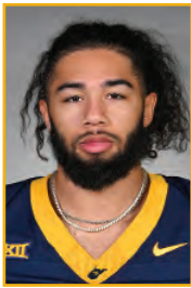
TE, 6-3, 235, Sr. Jacksonville State Martinsburg, W.Va.