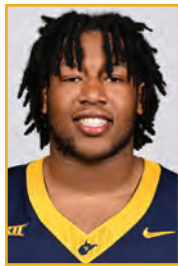
DL, 6-3, 295, So. Auburndale Auburndale, Fla.