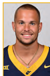
WR, 5-10, 188, r-Sr. Morgantown Morgantown, W.Va.