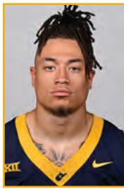
WR, 5-10, 181, Jr. Laurel Highlands Uniontown, Pa.