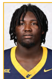
DL, 6-3, 296, r-Jr. Collins Hill Suwanee, Ga.