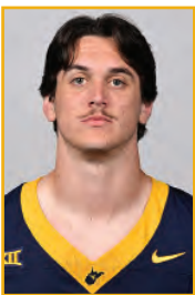
TE, 6-4, 223, Sr. Northern Illinois Rocklin, Calif.