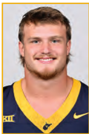
LB, 6-0, 226, Jr. East Lincoln Denver, N.C.