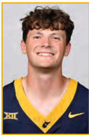
K, 6-2, 184, r-Sr. Fairmont Senior Fairmont, W.Va.