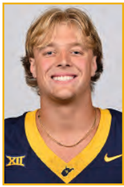
QB, 6-2, 213, Fr. Mentor Mentor, Ohio