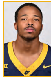
CB, 5-10, 185, r-Sr. Nevada Louisville, Miss.