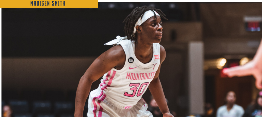
#19/20 WEST VIRGINIA VS. OKLAHOMA // FEB. 13, 2021 // WVU COLISEUM // OU 72, #19/21 WVU 71

MORGANTOWN, W.Va. – The No. 19/21-ranked West Virginia University women’s basketball team’s win streak was snapped at 11 wins after the Mountaineers suffered a 72-71 upset at the hands of Oklahoma, at the WVU Coliseum in Morgantown, on Saturday.