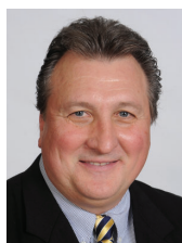
Bob HUGGINS Head Coach