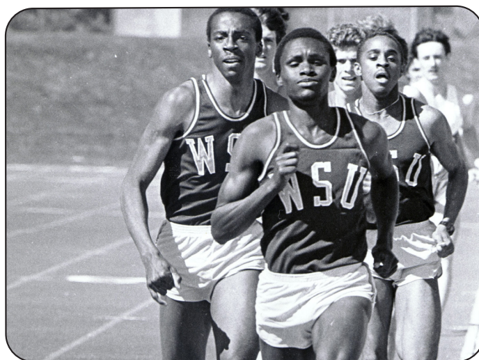
Julius Korir was the only collegiate athlete to ever win an NCAA 5,000m and steeplechase and then go on to win the gold medal in the steeplechase. Korir's steeple win at the 1984 Los Angeles Olympics was the only gold medal for Kenya at those games.