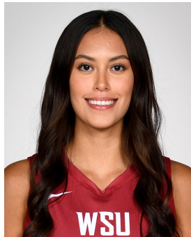
#12 ARGENTINA UNG