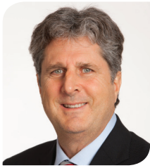
Head Coach Mike Leach (Field)