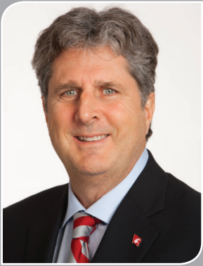
Mike LEACH Head Coach 7th Year

Mike Leach, the 2015 Pac-12 Co-Coach of the Year, is in his seventh season leading the Washington State Cougar football program after being named the Cougars' head football coach, Nov. 30, 2011. Leach has guided the Cougars to four bowl appearances in his first six years, a first for a WSU head coach, and the only head coach to lead WSU to three-straight bowl games.