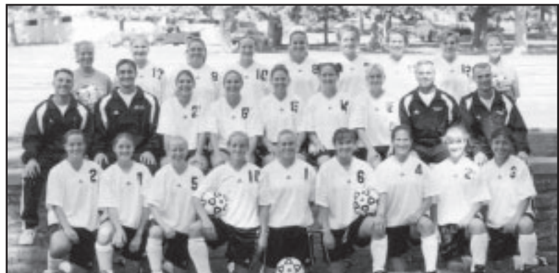
The 2000 WSC soccer team won a school record 18 games, going 18-4-1 overall while finishing third in the Northern Sun Conference that season with a 7-2 league mark.