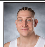
JR. // CENTER

Mins/Game: 30.0 Points/Game: 15.1 Shooting %: 42.8 Shot Attempts: 116-271 3pt Shooting %: 39.8 3pt Shooting: 53-133 Free Throw %: 78.0 FT Attempts: 78-100 Reb./Game: 4.2