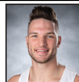
SR. // FORWARD

Mins/Game: 28.6 Points/Game: 8.3 Shooting %: 36.7 Shot Attempts: 65-177 3pt Shooting %: 37.5 3pt Shooting: 27-72 Free Throw %: 76.1 FT Attempts: 51-67 Reb./Game: 3.9