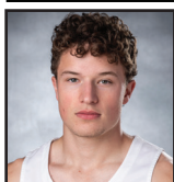
SR. // GUARD