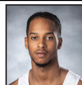
SO. // GUARD

Mins/Game: 28.5 Points/Game: 11.8 Shooting %: 59.6 Shot Attempts: 109-183 3pt Shooting %: 44.0 3pt Shooting: 11-25 Free Throw %: 60.7 FT Attempts: 65-107 Reb./Game: 6.9