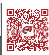
FULL 2025 ROSTER