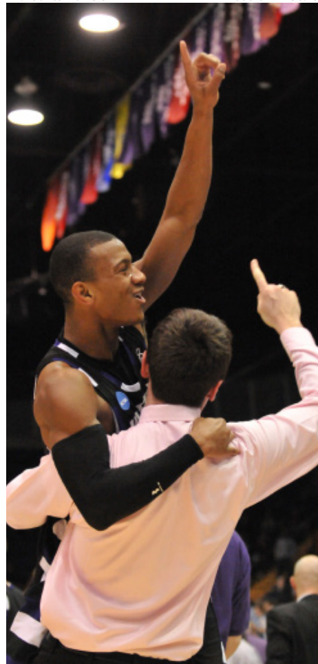
Championship in 2008. In Flowers' four seasons, the Warriors went 129-17, winning two National Titles.