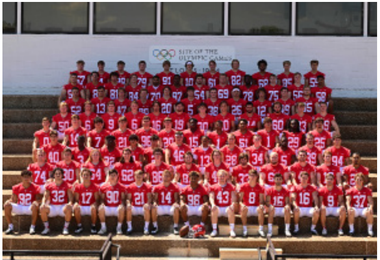
The 2021 team played in the program's first-ever bowl game, the inaugural Culver's Isthmus Bowl.