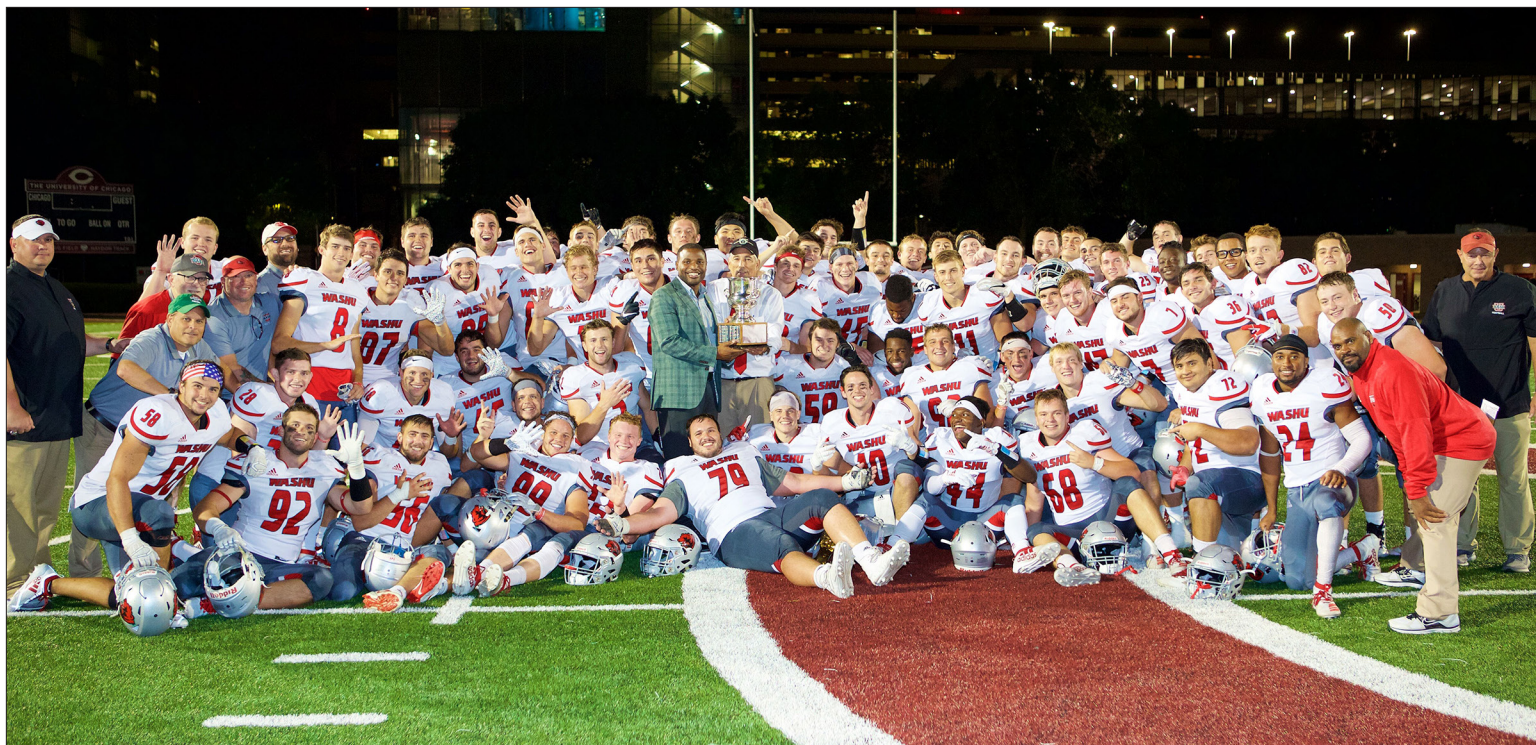
WashU celebrates after a 43-7 victory over the University of Chicago in the 2019 Founders Cup Game in Chicago. WashU has won 25 of the 34 Founders Cup Games.

To the victor go the spoils. And in the case of a yearly match between Washington University in St. Louis and the University of Chicago, the spoils include braggin' rights and the Founders Cup.