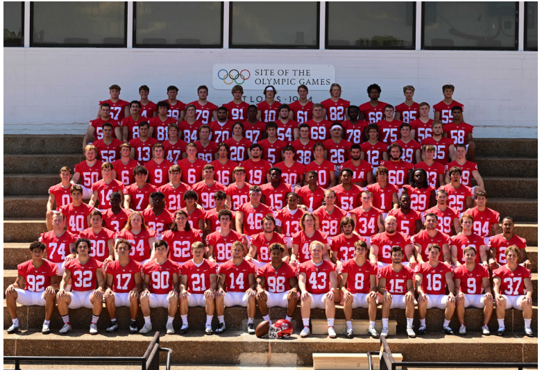
The 2021 team played in the program's first-ever bowl game, the inaugural Culver's Isthmus Bowl.