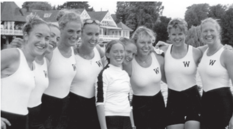
2000 Women's Henley Prize Winners