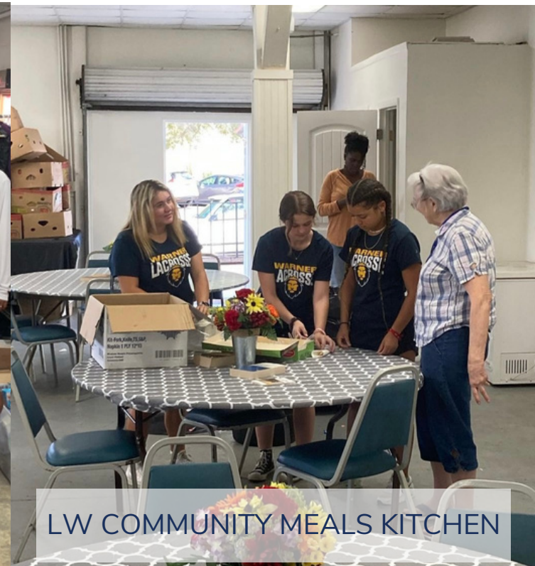
LW COMMUNITY MEALS KITCHEN