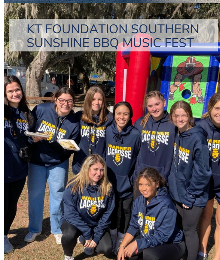
KT FOUNDATION SOUTHERN SUNSHINE BBQ MUSIC FEST