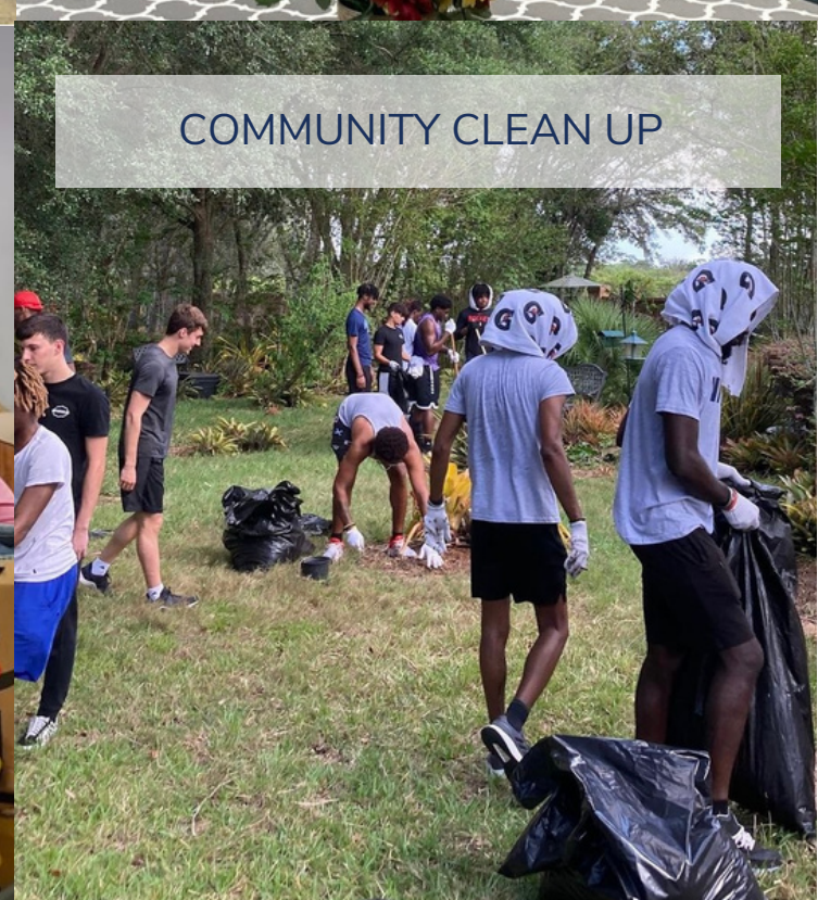
COMMUNITY CLEAN UP