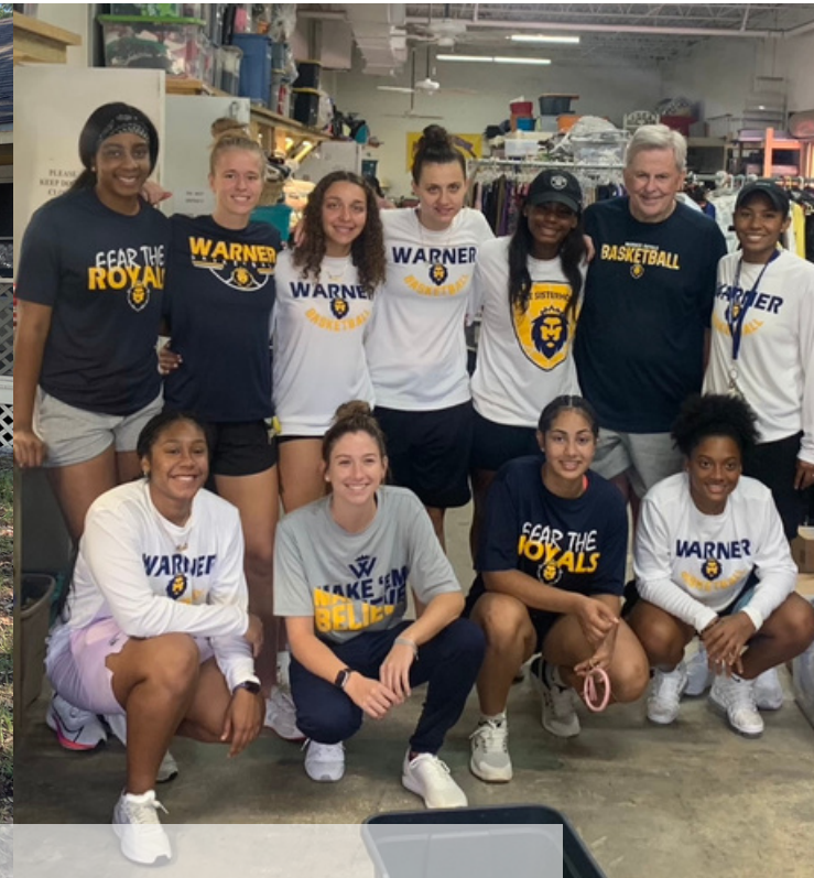
LAKE WALES CARE CENTER