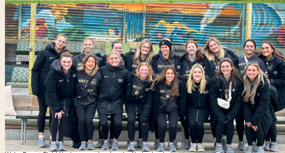
Wake Forest Field Hockey experiencing the Netherlands