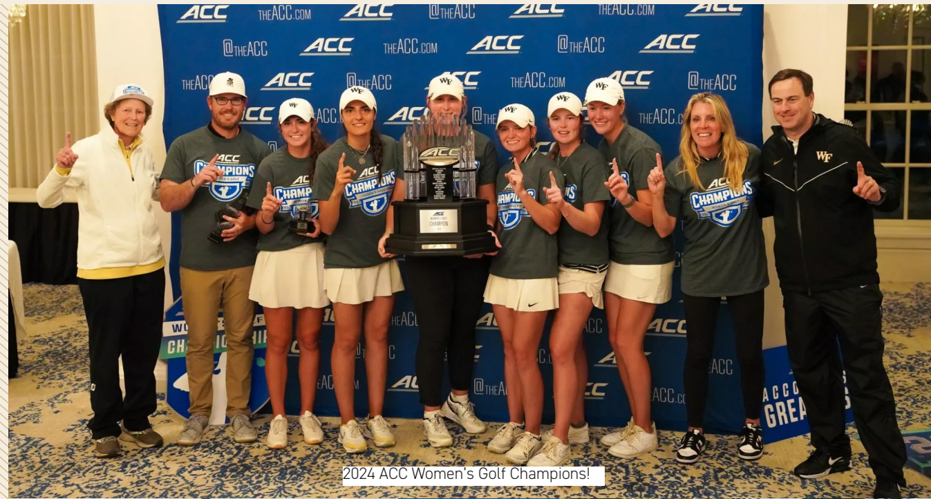
2024 ACC Women's Golf Champions!