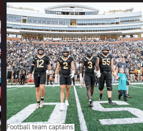
Football team captains