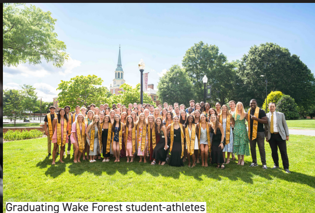
Graduating Wake Forest student-athletes