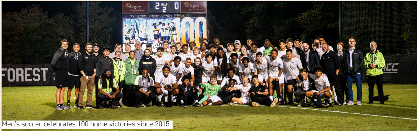
Men's soccer celebrates 100 home victories since 2015