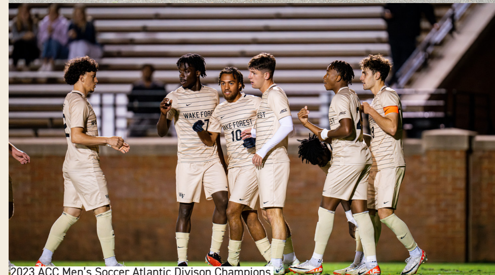
2023 ACC Men's Soccer Atlantic Division Champions