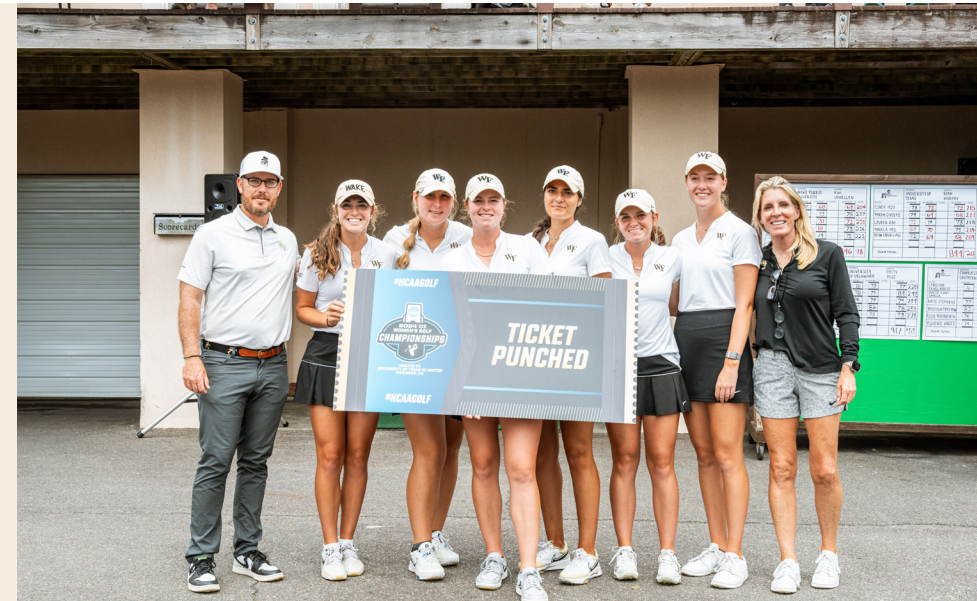
2024 ACC Women's Golf Champions