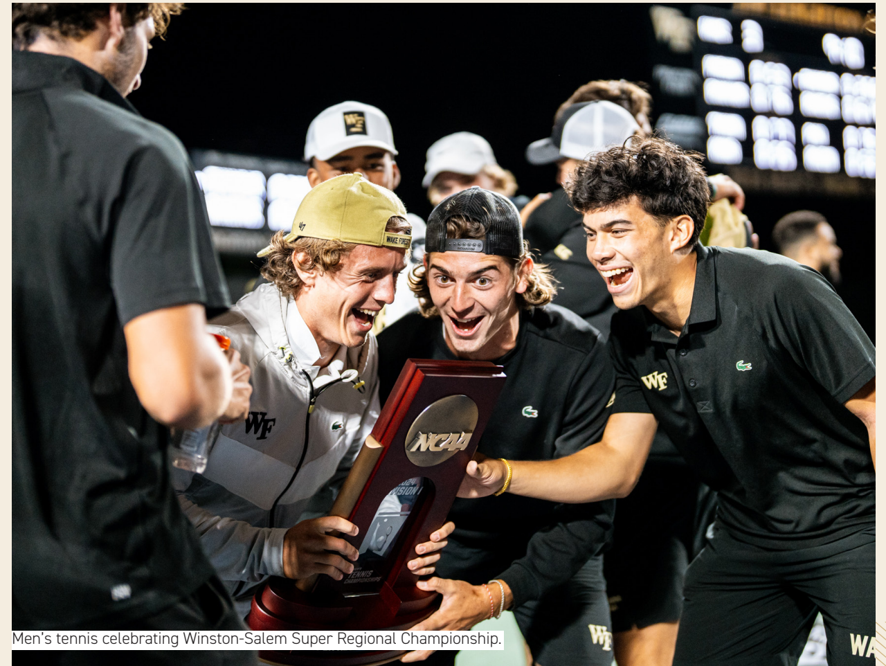
Men's tennis celebrating Winston-Salem Super Regional Championship.