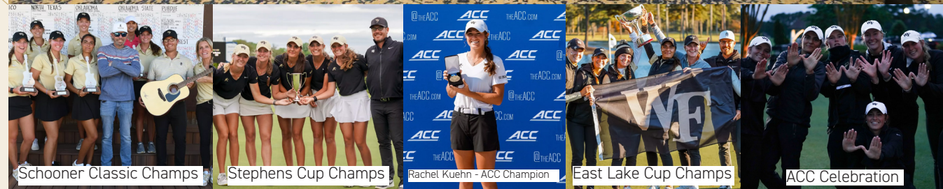
Schooner Classic Champs