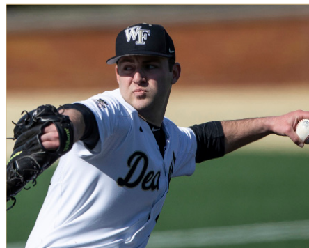
2023 WAKE FOREST BASEBALL / GODEACS.COM / @WAKEBASEBALL