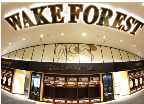
2023 WAKE FOREST BASEBALL / GODEACS.COM / @WAKEBASEBALL