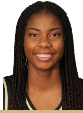
#1 ANAIA HOARD