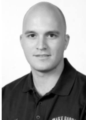
ASSISTANT COACH First Season