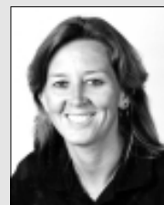
Roxann Moody Equipment