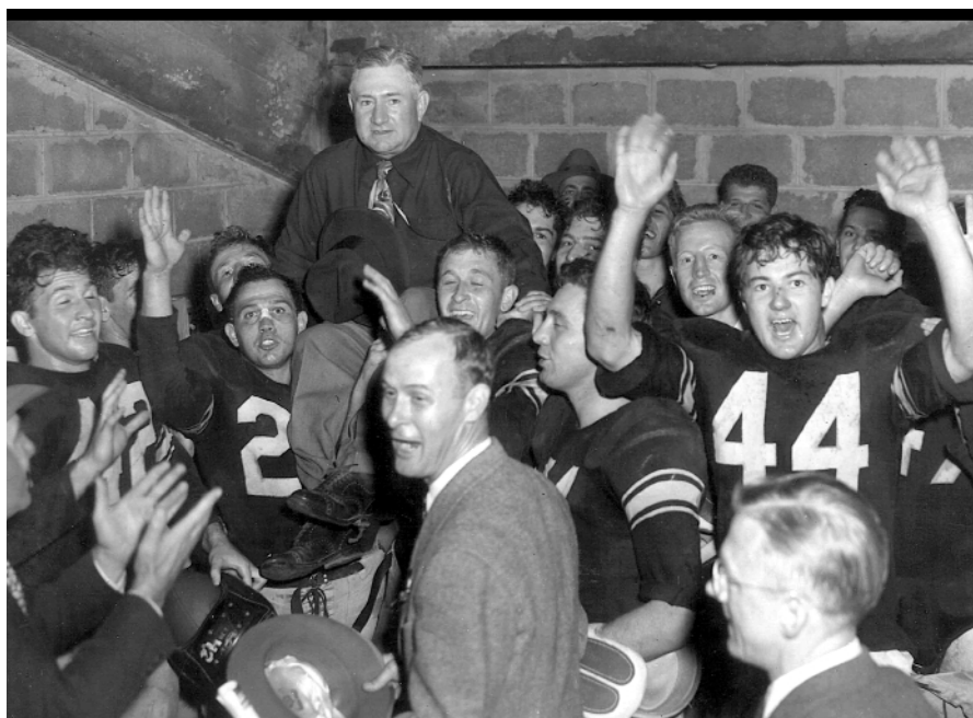
The 1946 Wake Forest team, shown here celebrating its win at No. 4 Tennessee, helped put together a school-record eight game road winning streak

Statistics, except Wins & Losses and Streaks, do not include bowl games prior to 2002.