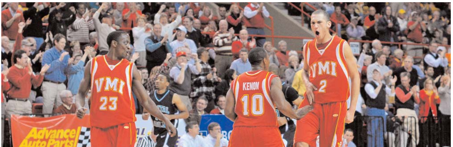
The Keydets celebrate after beating Coastal Carolina in the 2008-09 Big South Championship at Cameron Hall.