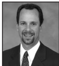
Kyle Kallander Commissioner