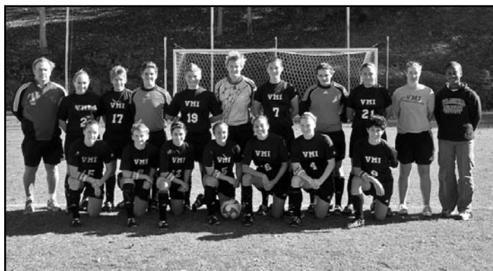
The 2007 team made the program's postseason debut with a 1-0 loss to top-seeded Coastal last November.