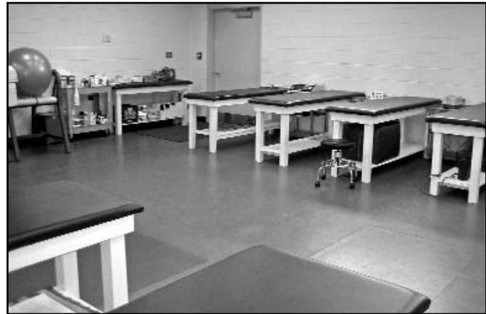
The Clarkson-McKenna Training Room services the Keydet football team and is one of three such facilities on post.

The Sports Medicine Department is also grateful to be involved with many physicians in the Lexington area which play an integral part in the health care of cadet athletes. These physicians have always been very generous with their time and efforts on behalf of VMI athletes.