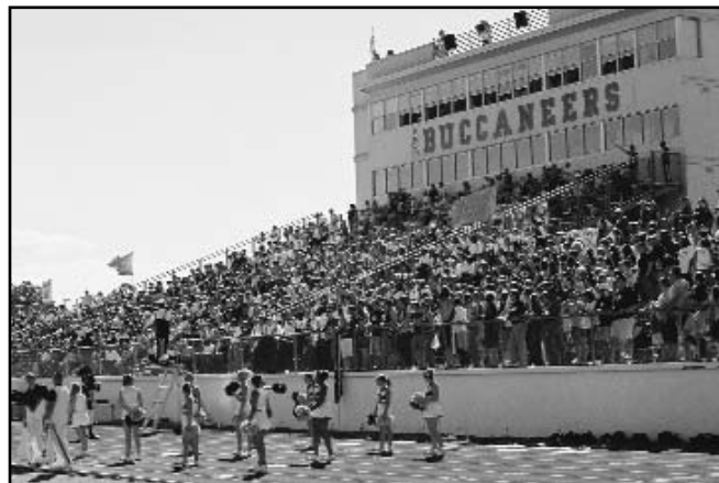
CSU Stadium Charleston Southern University North Charleston, S.C. November 1, 2008