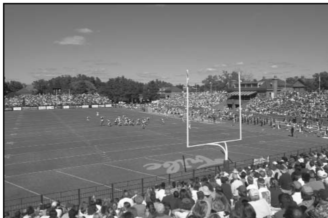
Zable Stadium College of William & Mary Williamsburg, Va. September 13, 2008