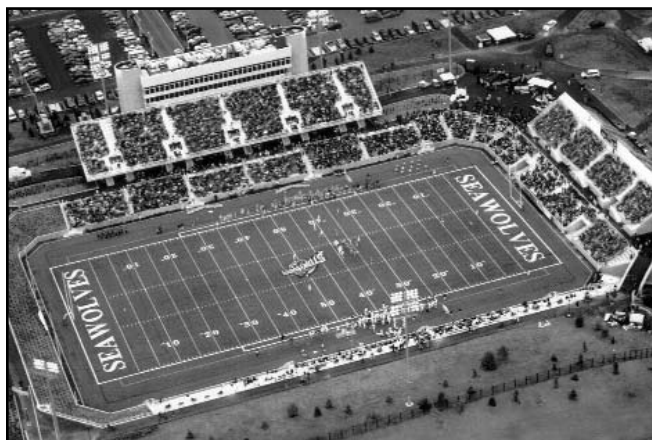
LaValle Stadium Stony Brook University Stony Brook, N.Y. November 15, 2008