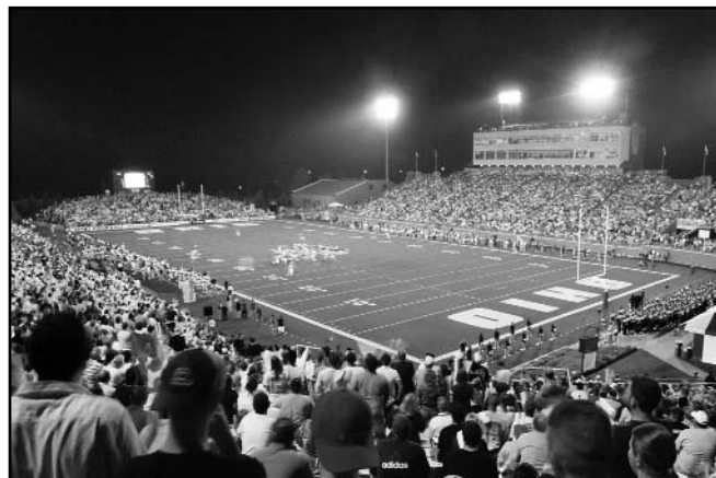
Peden Stadium Ohio University Athens, Ohio September 27, 2008