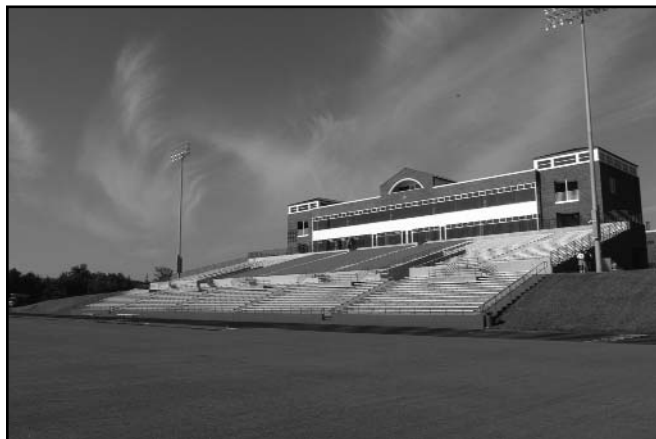
Spangler Stadium Gardner-Webb University Boiling Springs, N.C. October 25, 2008