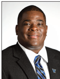
Dustin Johnson Cornerbacks