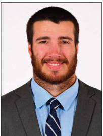
Forrest Rhyme Linebackers