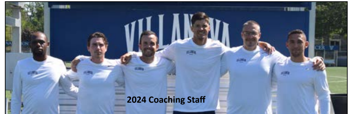
2024 Coaching Staff

1991 Semifinals: #1 Seton Hall 4, #4 Villanova 0 1993 Semifinals: #1 St. John's 6, #4 Villanova 4 1997 Quarterfinals: #3 Rutgers 2, #6 Villanova 0 2003 Quarterfinals: #1 St. John's 2, #8 Villanova 1 (Overtime) 2004 Quarterfinals: #5 Georgetown 1, #4 Villanova 1* 2005 Opening Round: #4 Blue Georgetown 2, #3 Red Villanova 2* Georgetown advances on penalty kicks 2007 Opening Round: #2 Blue West Virginia 2, #4 Red Villanova 0 2008 Opening Round: #3 Blue Providence 2, #6 Red Villanova 1 2009 Opening Round: #5 Blue Providence 2, #4 Red Villanova 1 2010 Opening Round: #5 Blue Providence 3, #4 Red Villanova 0 2011 Opening Round: #5 Red Villanova 1, #4 Blue Notre Dame 0 2011 Quarterfinal: #5 Red Villanova 1, #1 Red USF 0 2011 Semifinal: #2 Red St. John's 2, #5 Red Villanova 0 2012 Opening Round: #4 Red Villanova 3, #5 Blue Seton Hall 1 2012 Quarterfinal: #1 Blue Connecticut 1, #4 Red Villanova 0 2014 Opening Round: #4 Providence 2, #5 Villanova 1 2016 Opening Round: #4 Villanova 0, #5 DePaul 0 (2 OT) *Villanova advances on penalty kicks 2016 Semifinals: #2 Butler 1, #4 Villanova 0 (2 OT) 2021 Opening Round: #6 VU 2, #3 Creighton 1 2021 Semifinal: #1 Georgetown 1, #6 VU 0