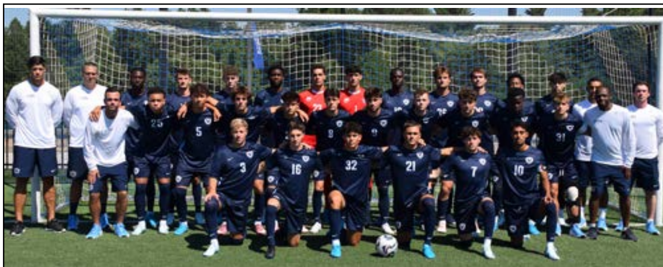
The 2024 Villanova Wildcats