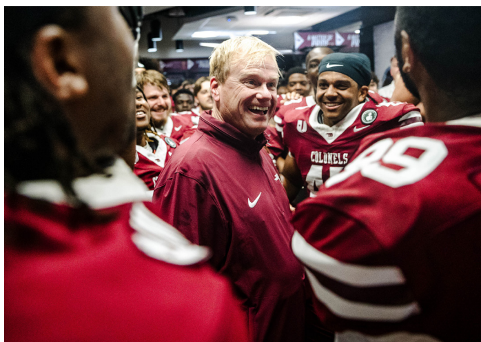
Booth each earned national player of the week honors as well.

During the fall 2020 season, Eastern ranked second in the nation in interceptions and passing efficiency, and third in first downs, passing offense, passing yards per completion, fumbles recovered and turnovers gained.