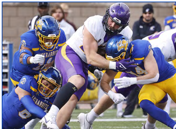
The South Dakota State defense forced five first-half turnovers and held Northern Iowa out of the end zone in a 41-6 Hobo Day victory on Oct. 15.

UNI was limited to 40 net yards rushing as the Jackrabbits sacked Day four times. The UNI signal-caller completed 16-of-24 passes for 210 yards, with Sam Schnee leading the Panthers with 104 yards on four catches, including a 66-yard reception in the fourth quarter.