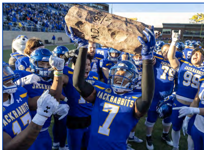
South Dakota State hoisted the Dakota Marker for the fourth season in a row after a 33-16 win over North Dakota State before a record crowd of 19,431 at Dana J. Dykhouse Stadium.