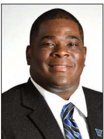
Dustin Johnson Cornerbacks