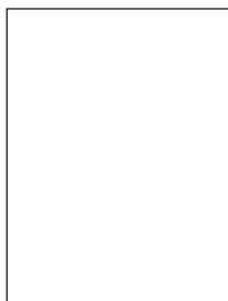
Lachlan Kline Tight Ends