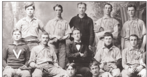
A team photo of one of the earliest Villanova baseball teams.