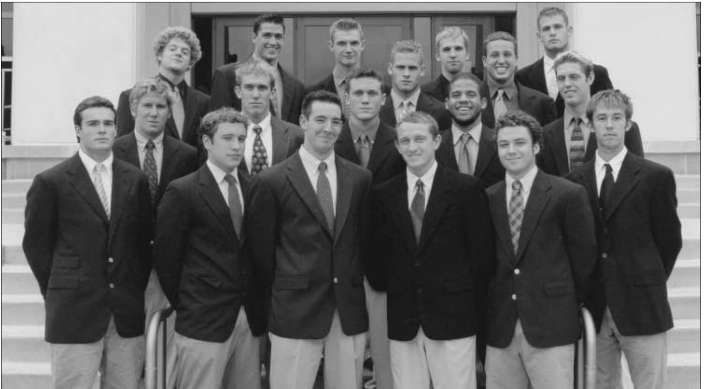
2003-2004 Villanova University men's swimming & diving team.