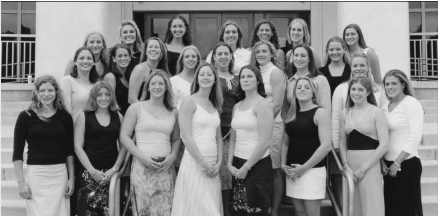
2003-2004 Villanova University women's swimming & diving team.