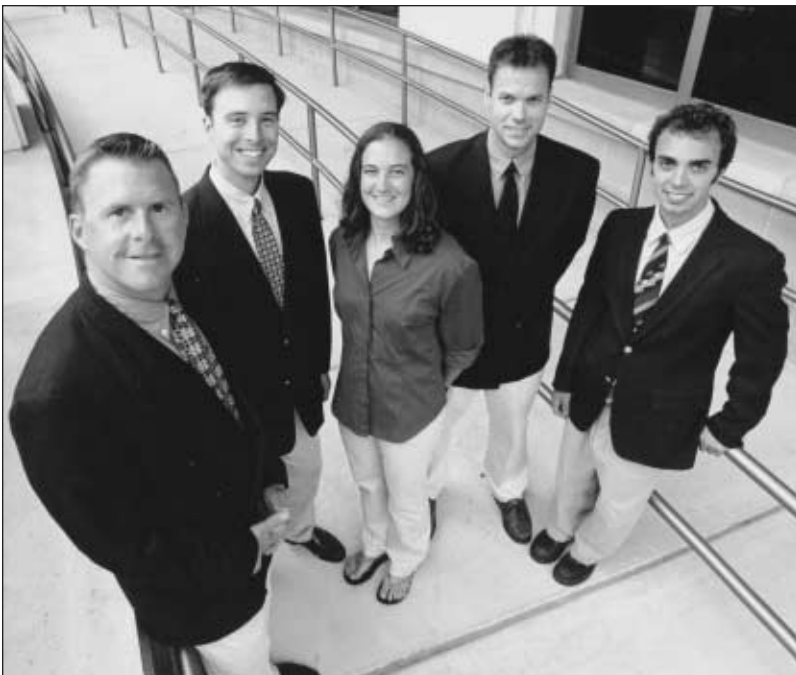
The 2003-2004 Villanova Swimming & Diving coaching staff