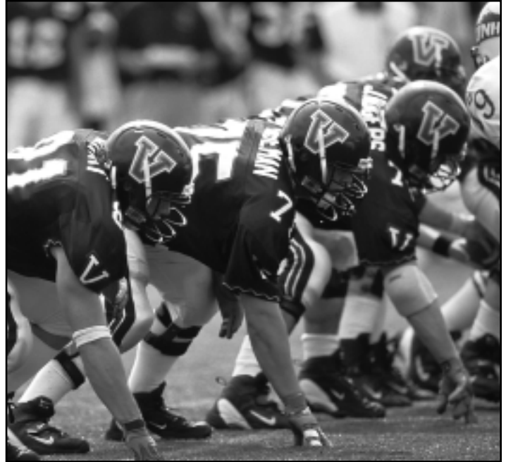
Villanova returns four starters along the offensive line in 2003.