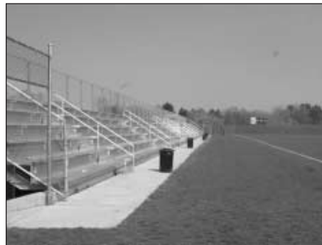
During the summer of 1999, the Villanova Soccer Complex got a new look with permanent bleachers being added to seat up to 1,000 people.