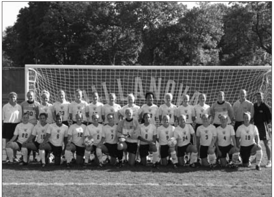
The 2001 Villanova women's soccer team recorded the second highest single-season win total in school history (13) and earned the program's first-ever NCAA Tournament berth.