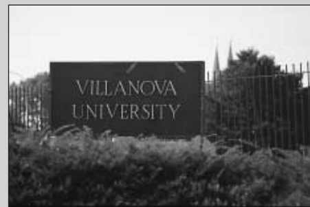
A look at the front of the Villanova campus with the Church of St. Thomas of Villanova in the background.