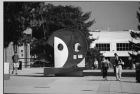
A view from the center of Villanova's beautiful Main Line campus.

For information on Villanova University's Athletic Schedules, contact the Athletic Department at 610-519-4090.