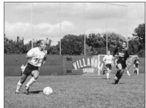
An in-game look at the scenic Villanova Soccer Complex