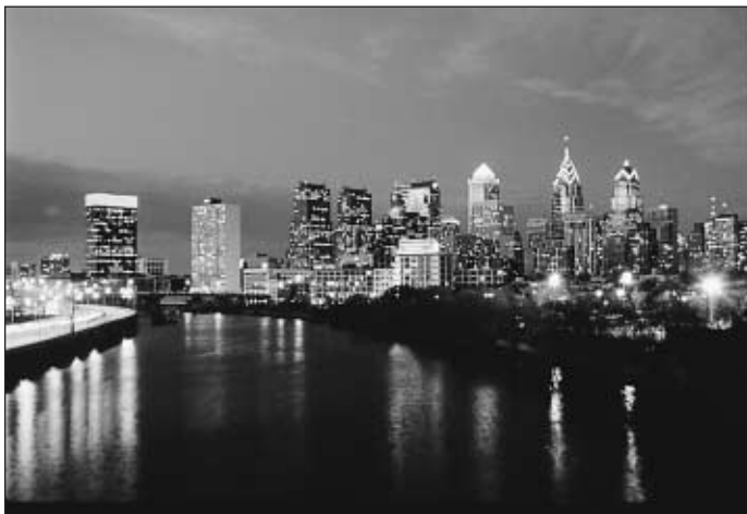
Philadelphia provides Villanova University students with a big city atmosphere

Philadelphia collegiate sport's rivalries are another luxury that the city has to offer. Whether observing or playing, the heated battles that take place on the fields of play go unmatched. The resurrection of the full Big Five men's basketball schedule has helped continue to make Philadelphia one of the greatest sports cities in the country.